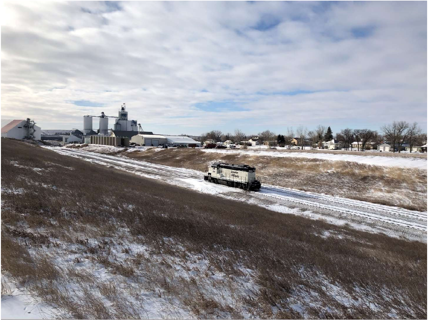
Figure 5: Scranton Equi-Rail Railroad Spur