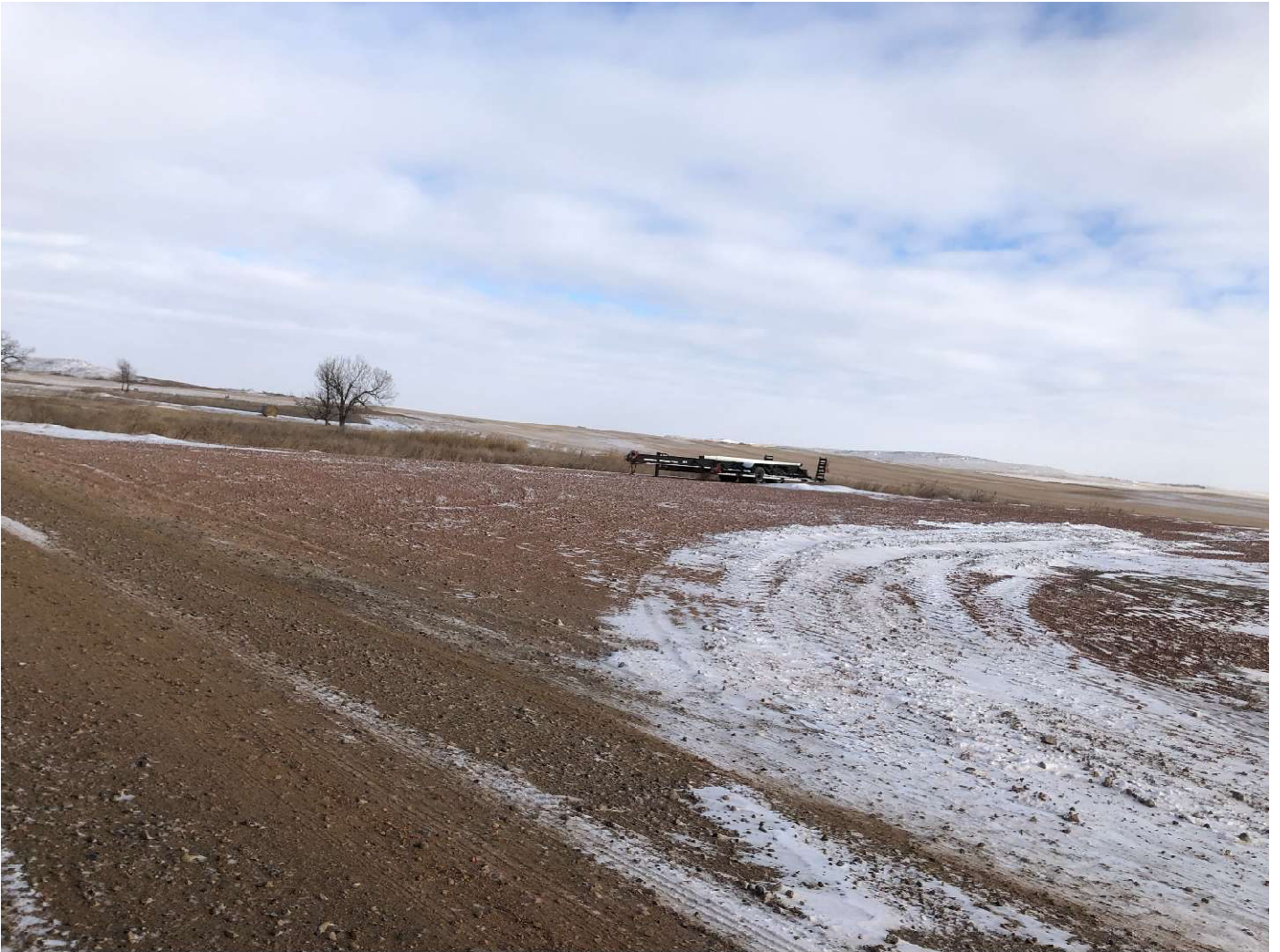
Figure 3: Parking Lot Adjacent to Access Road to Scranton Equity