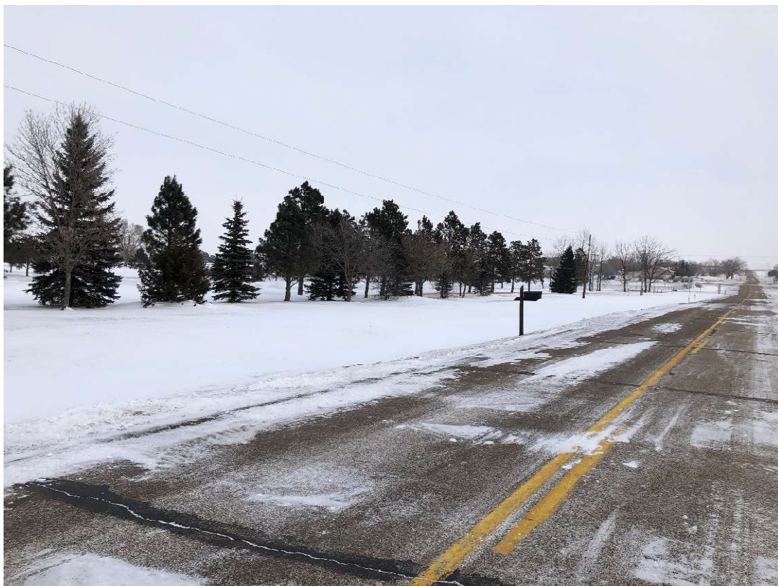
Figure 9: HWY 10 Right of Way, New Salem