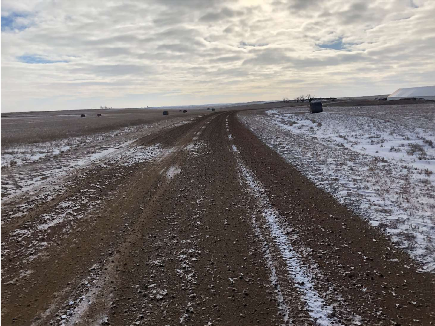
Figure 2: Access Road to Scranton Equity