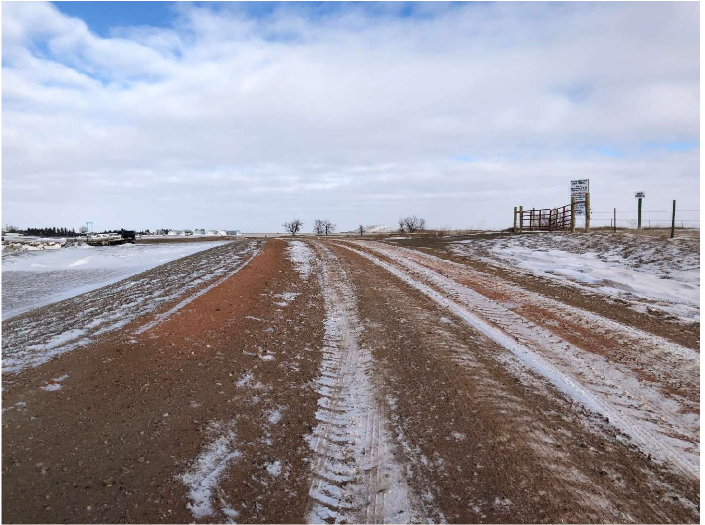
Figure 4: Access Road to Scranton Equity