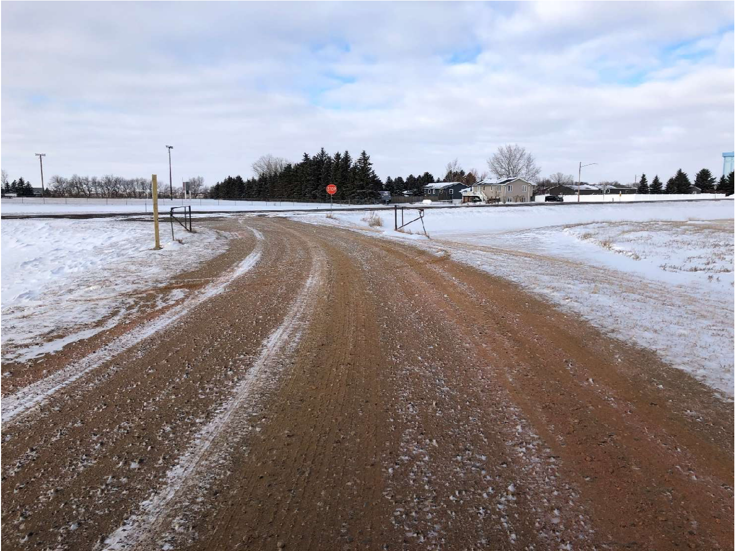
Figure 1: Access Road to Scranton Equity