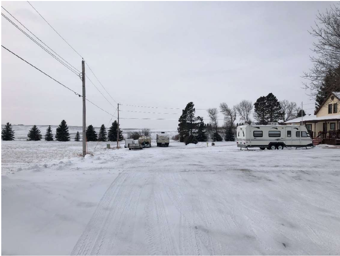
Figure 8: New Salem Right of Way