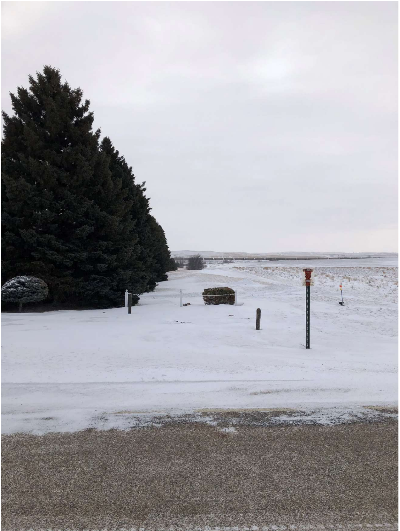
Figure 7: New Salem Right of Way