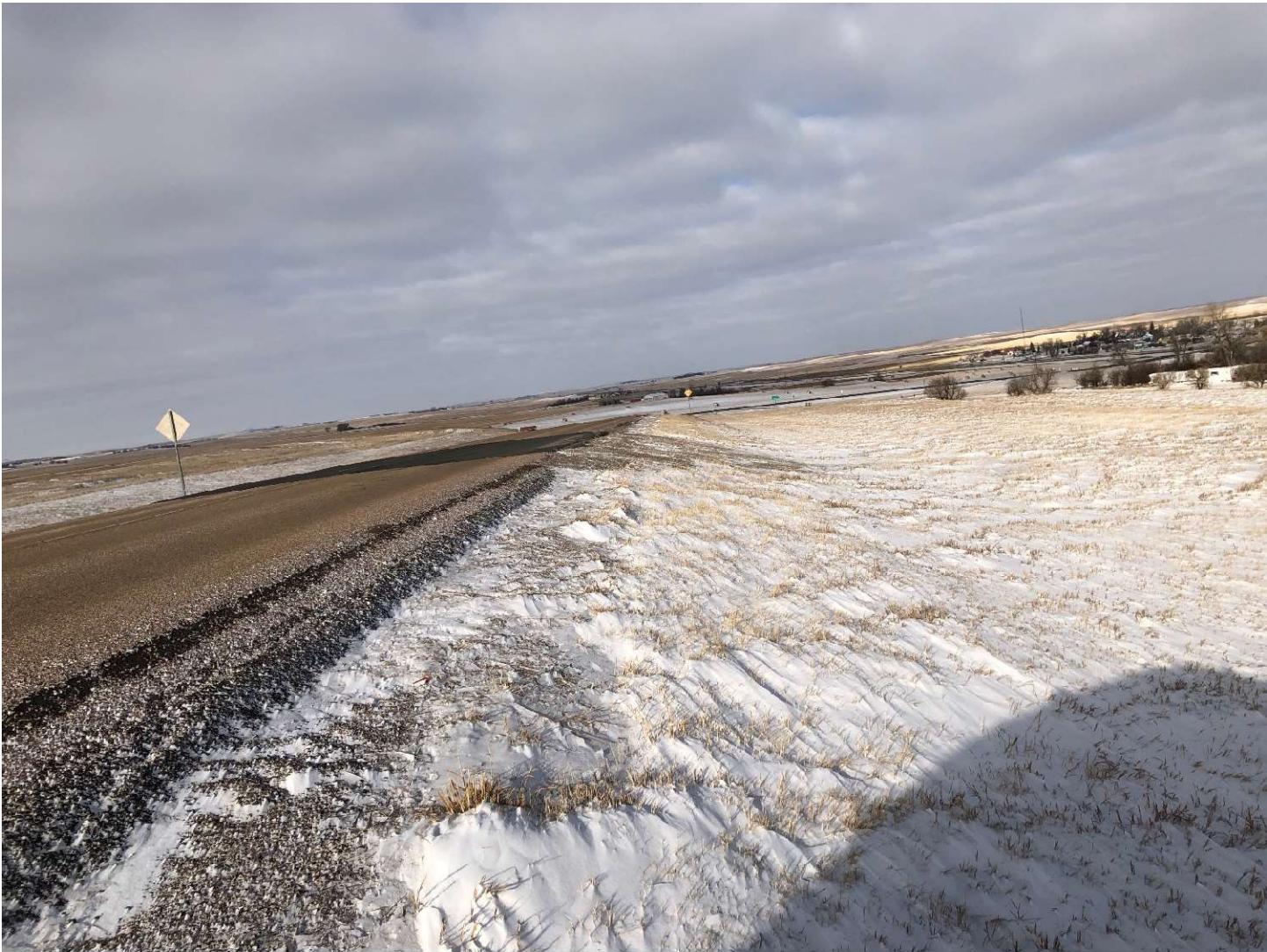
Figure 6: Bowman County Right of Way